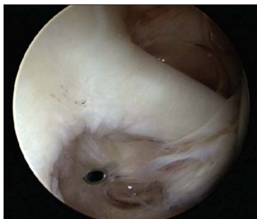
Figure 2 – An arthroscopic view shows a torn biceps sling causing medial subluxation of the long head of the biceps tendon. This common source of pain often requires tenotomy or tenodesis.

When conservative management of a partial-thickness tendon tear has not been successful, arthroscopic evaluation provides crucial evaluation of the thickness of the articular- and bursal-sided tears. This is especially true with respect to ar-